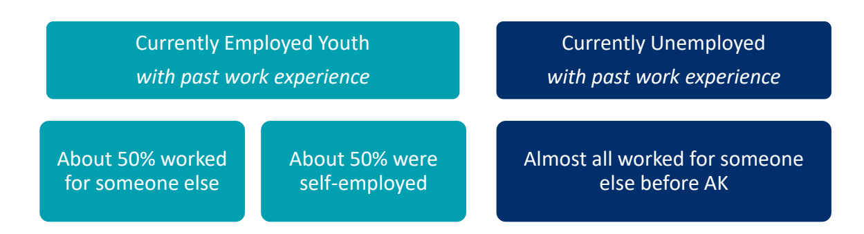
Table 2 shows the work experience of youth in the study according to their employment status.