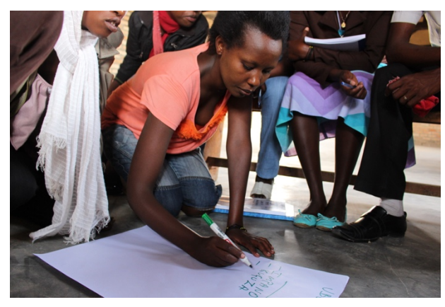
An Akazi Kanoze participant takes notes for her group during a work readiness training.

The Akazi Kanoze (AK) Youth Livelihoods Project was a seven-year, $12.5 million project financed by the United States Agency for International Development (USAID) and implemented by Education Development Center, Inc. (EDC), between October 2009 and September 2016. The project provided youth ages 14–35<sup>1</sup> with market-relevant life and work readiness training and support, including hands-on training, links to employers, and self-employment opportunities. The AK project trained more than 21,000 Rwandan youth; 52% are female and 47% reside in rural areas. The project targeted two results: