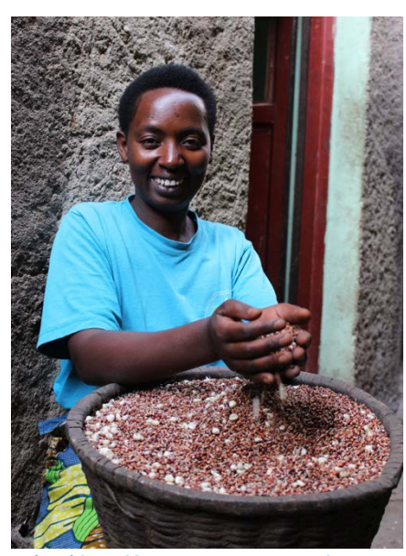
An Akazi Kanoze participant shows the product of her IGA.

Among the unemployed AK graduates in the study, only a quarter of them did not start an IGA or successfully apply for a job, primarily because they were engaged in educational activities. Since graduation, unemployed